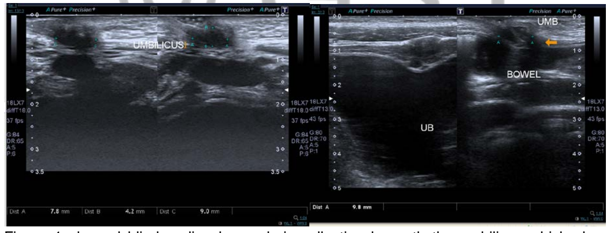
Figure 1 showed blind ending hypoechoic collection beneath the umbilicus which shows urachal cyst/sinus.

An abdominal ultrasound (Figure 1) done for the child showed that there is a blind ending hypoechoic collection beneath the umbilicus measuring 0.9 x 0.5cm which suggested urachal sinus. There is no no demonstrable communication to the urinary bladder, and bilateral kidneys scanned are normal. The urinary bladder is underfilled with wall thickening which suggests cystitis.